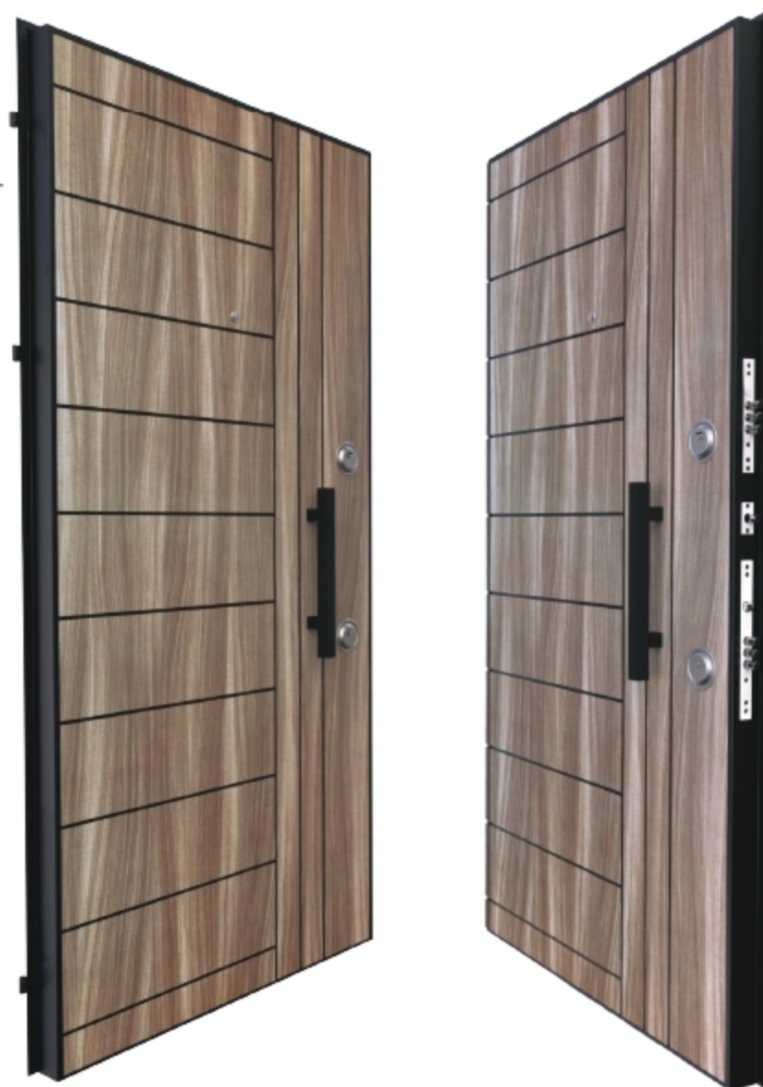
DOOR WITH MONOBLOC LOCKING SYSTEM